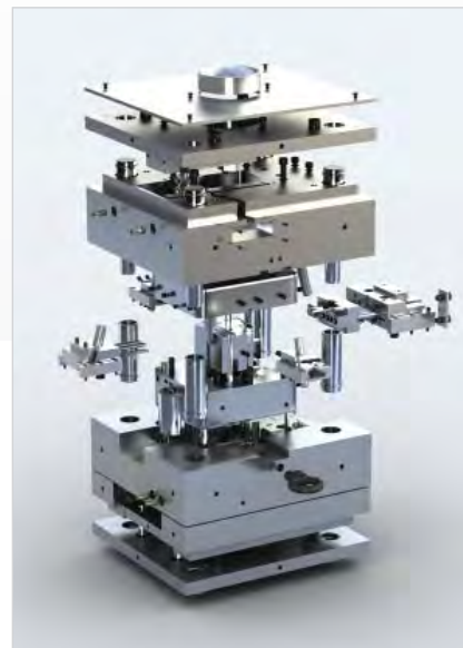
This moldbase was developed with Creo Expert Moldbase Extension and rendered in Creo Parametric.