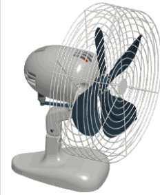
Design Exploration session : Full Cage Session name: FAN_DEX